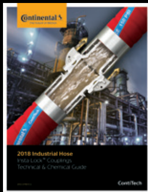
Industrial Hose Insta-Lock™ Couplings Technical & Chemical Guide